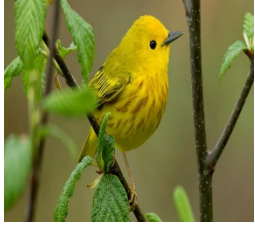
(All about birds.org)