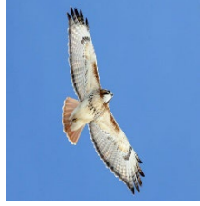
(All about birds.org)